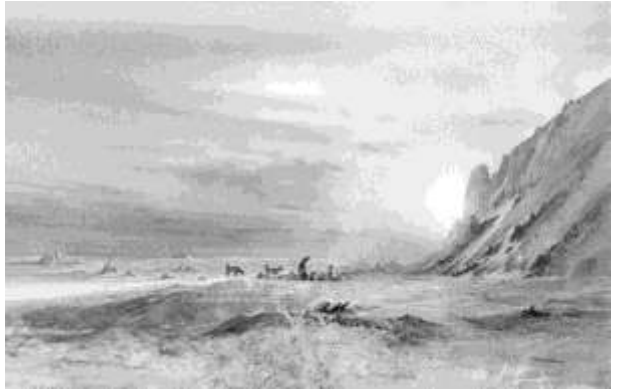
Arctic Sunrise (watercolour by David Bellamy)

It is due to be published by Search Press in May 2017 and includes many encounters with wildlife, many of which have happily posed while I sketch. The walrus is a most obliging fellow in that respect, despite the rather rude noises at times, but I have had many less considerate models. Pitching through wild Arctic seas for hour after hour was not my happiest time, especially as I am not a sailor, but this was a necessary part of the trip, while dog-sledging across the Greenland mountains and sea ice in search of polar bears and other subjects was by comparison, much more comfortable. I shall be writing articles, blogs and other pieces relating to the practical side to painting these scenes from the book closer to the time of publication, so keep an eye on my website and blogs for this.